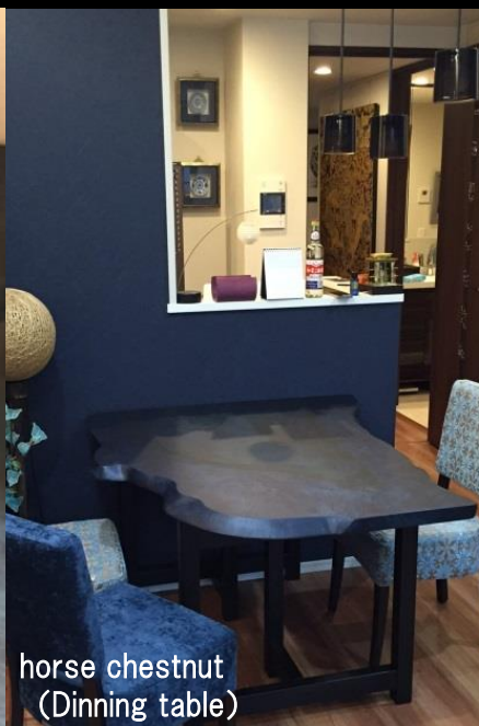
horse chestnut (Dinning table)