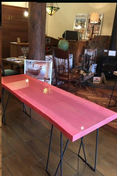
Hop hornbeam (piano painting)