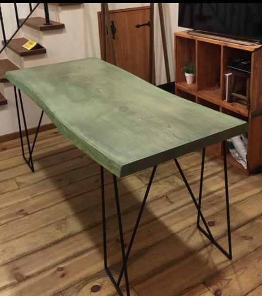
Castor aralia (plant dyeing)