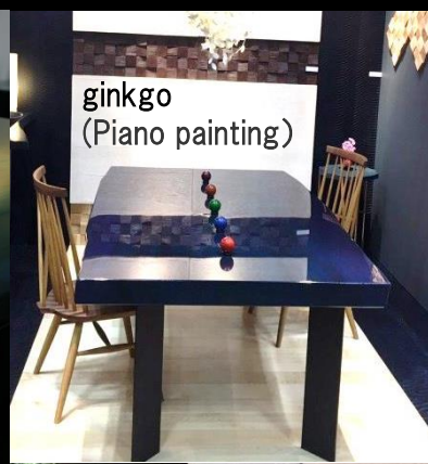
ginkgo (Piano painting)