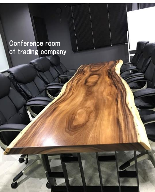
Conference room of trading company