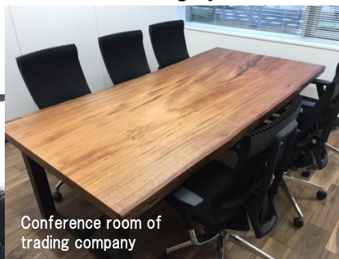
Conference room of trading company