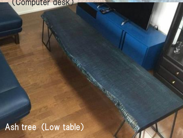
Ash tree (Low table)