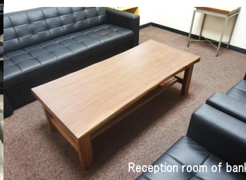
Reception room of bank