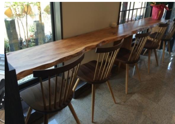
Japanese raisin tree

It is used Japanese raisin tree for a long table in a pretty café.