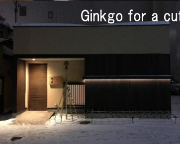
Ginkgo for a cutting board

It is used Afrormosia (7m long) for a main counter and zebra wood (6m long) for a sub counter at a Japanese restaurant in Osaka.