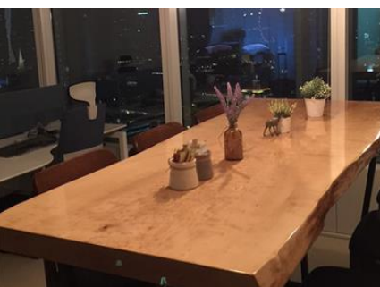
Birds Eye maple