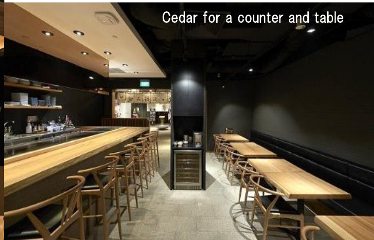
Cedar for a counter and table

Japanese restaurant in Susukino, Hokkaido The chef in this premium restaurant is pleased with this original cutting board.