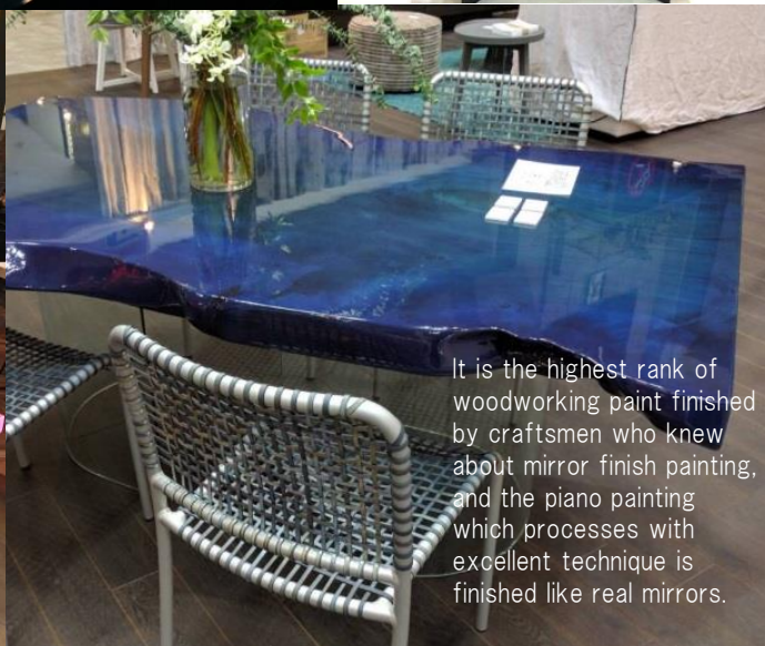
Horse chestnut (piano painting with gradation)

It is the highest rank of woodworking paint finished by craftsmen who knew about mirror finish painting, and the piano painting which processes with excellent technique is finished like real mirrors.